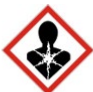
GHS08 Health hazard