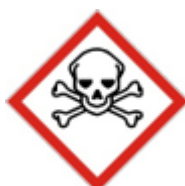
GHS06 Acute toxicity